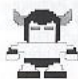
BUFFALO MAN Hurricane Mixer